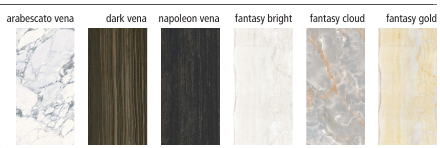
(Arabescato vena only available in 120x60)