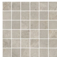
2x2 Mosaic on 12x12 Sheet Matte