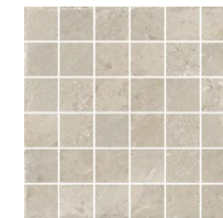
2x2 Mosaic on 12x12 Sheet Matte