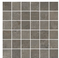
2x2 Mosaic on 12x12 Sheet Matte