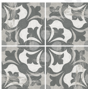
Lis - Smoke (SMOKE/ICE)