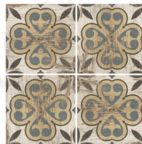
Flor - Colors (MULTI)