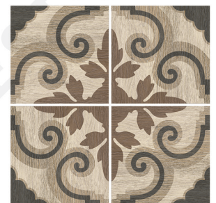
Medi - Moka (MOKA/MALT)

Always inspect materials prior to installation. Always mix 2-3 cartons at a time while installing to ensure the best blend. All product images are representative only. Variation in color and shading is to be expected. Final selection should be made from actual tile samples.